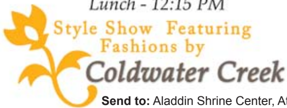
Table of 8 - $200.00